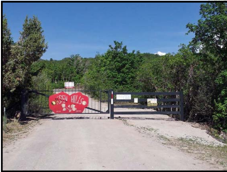
North Entrance to Aspen Hills