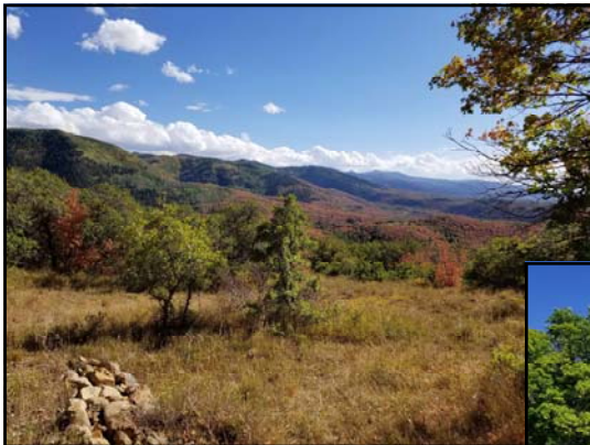
View From Lot 958

Aspen Hills is located approximately 6.4 miles Southeast of Fairview in Northern Sanpete County. Some lots have been excavated for a cabin/camp site. A key is needed to gain access to see these properties. Check the "Showing Schedule" on the internet site below to verify when a key is available. Call John at (801) 580-1898 to borrow a key or schedule a showing.