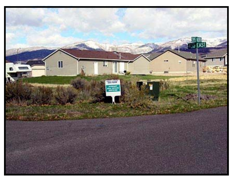
430 East 285 North, Mt. Pleasant